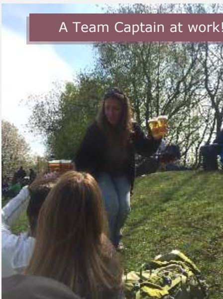
A Team Captain at work!